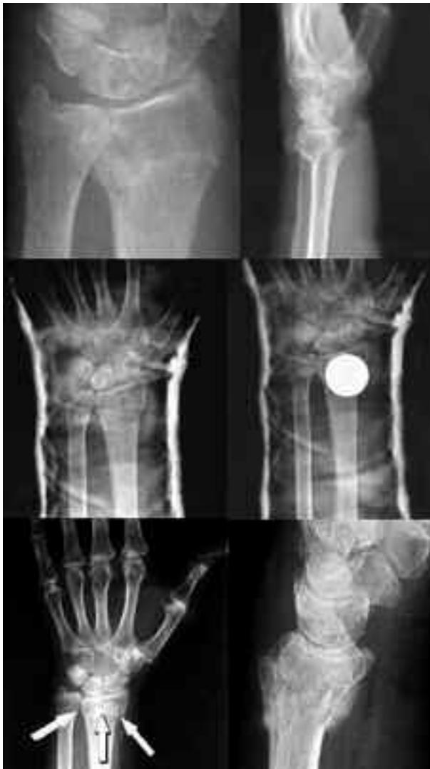
Figure 3. Fracture of the distal epiphysis of the left radius with dorsal dislocation, without metaphyseal fragmentation. X-ray of the fracture after reduction and placement in a plaster cast with and without a magnet and at the removal of the cast with presence of bone callus

Fractures of the wrist with dorsal dislocation and without metaphyseal fragmentation (Fig. 3) were treated with closed reduction after local anesthesia and with immobilization in a synthetic brachioradial-metacarpal plaster cast (combicast) in which a quadrupolar magnet was placed at the same level of the fracture gap. The average immobilization period was of 21.5 days.