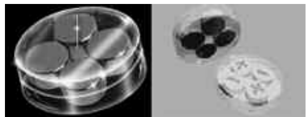
Figure 1. "Rare earth" quadrupolar magnets in which 4 blocks are highlighted