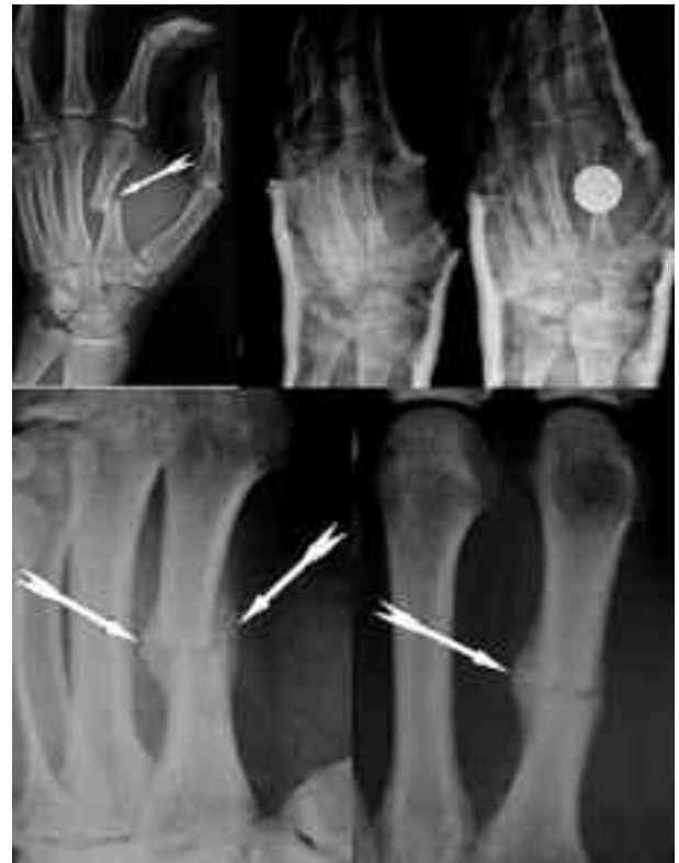
Figure 4. Dislocated fracture of the medial 1/3 second metacarpal of the left hand. X-ray of the fracture after reduction and placement in a plaster cast with and without a magnet and at the removal of the cast with presence of abundant bone callus

Fractures of the wrist with dorsal dislocation and metaphyseal fragmentation were treated with reduc-